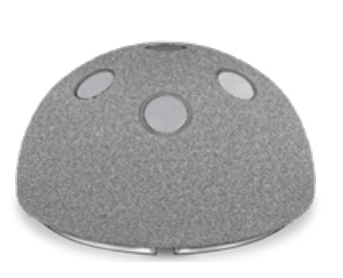
PlasmaLink Cluster Hole