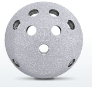
TiCaP Multi Hole