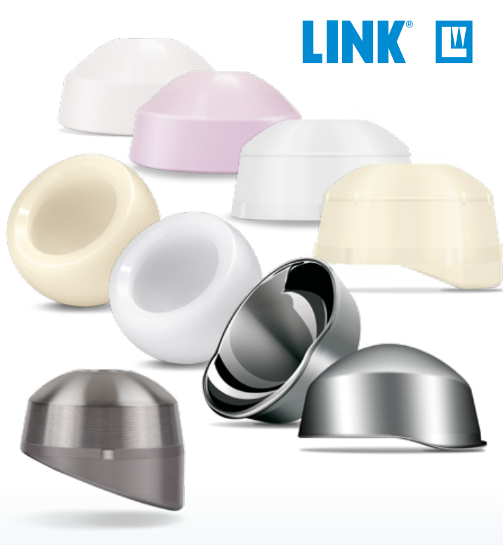
MobileLink Acetabular Cup System