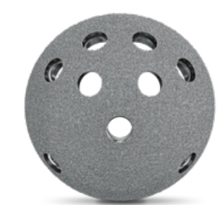
PlasmaLink Multi Hole